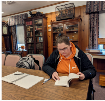
Speare Library research