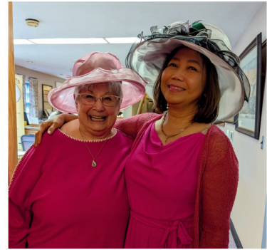
Posh Pink Tea Party March 2024