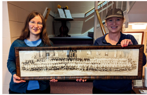
Much appreciated donations