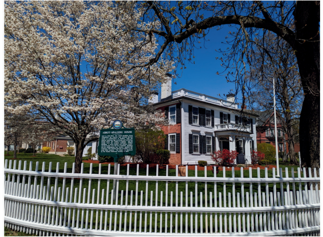
Abbot-Spalding House in the springtime 2024

Greetings to my fellow historians, and a big thank-you for doing such a great job preserving the past for the future.