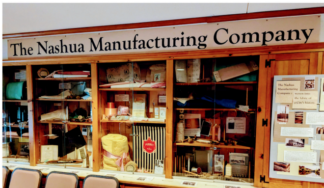
Nashua Manufacturing Company exhibit in the Florence H. Speare Memorial Museum

My job was to watch the bobbins which took 4 hours for a bobbin to be filled. The thread could break and it was my job to retreat the bobbin, you had to react quickly to catch the bobbin because it would not stop spinning which was the hardest part of learning the job. If you were too slow, the bobbin would turn in your hand cause a burn. I very seldom had breaks or lunchtime. You were on the run. I had a wooden box that I placed my lunch on and kept it covered otherwise I would be eating a lot of cotton with my sandwich. When I passed my lunch, I would take a bite and keep on working, and that's the way it was done, on the run. It was hard, but I did my work and was happy to have a job.