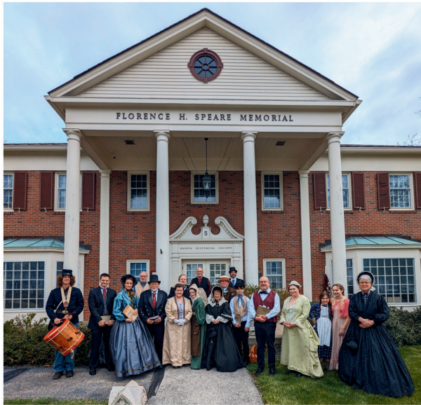
Notable Nashuans Reenactors May 7, 2024

Issue No. 1 Summer 2024 www.nashuahistoricalsociety.org