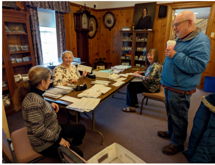
Balloting for elections prepped