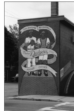
Dodgers Mural West Hollis & Elm streets