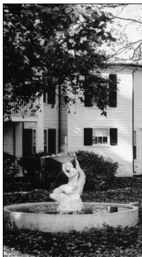
The Taras Fountain Abbot-Spalding House